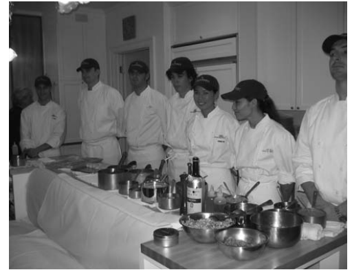
Charlie Trotter's Chefs