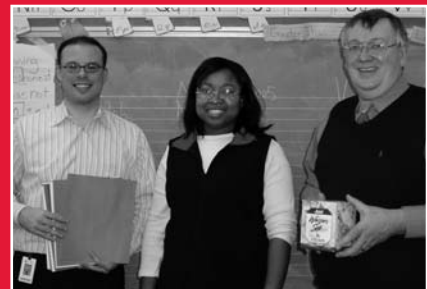
Top: ALA Holiday Party