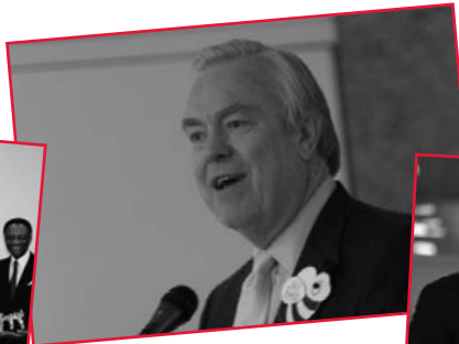
Pronouncer Bill Kurtis