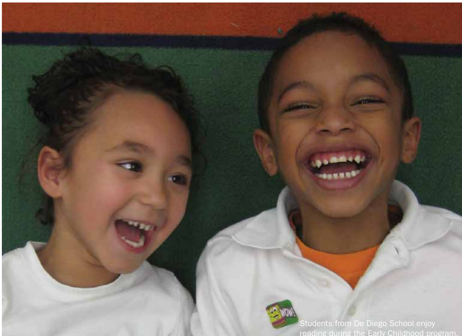
Students from De Diego School enjoy reading during the Early Childhood program.